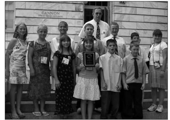
Eaton Elementary's NEED students.

The NEED program includes innovative curriculum materials, professional development,